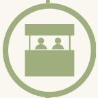
Exhibit Booth: $3,000

Put a brief message or announcement in front of all conference attendees via the SER2025 mobile app.